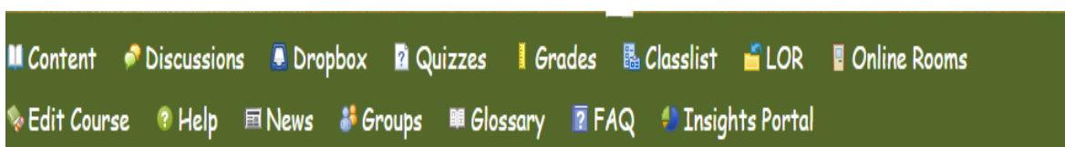
Figure 1. Electronic tools